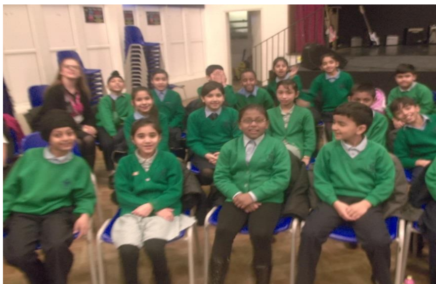
Havelock Choir at Songfest (Featherstone High School)