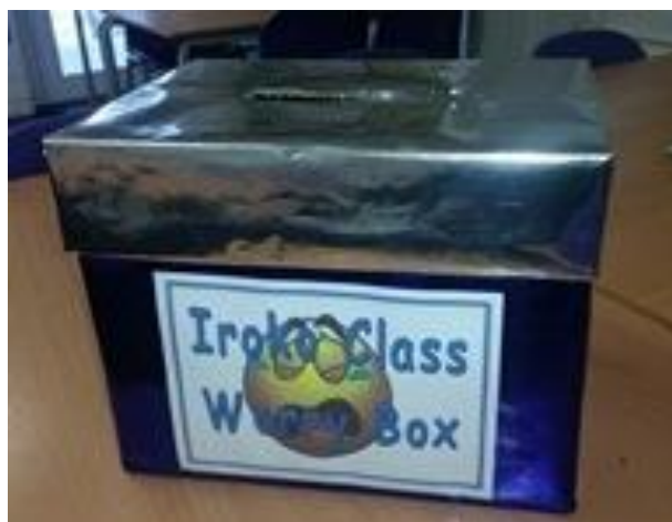
Iroko class "WORRY BOX"